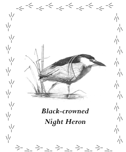
Black-crowned Night Heron

Please order from kendall@sopris.net or call 970-928-8358.